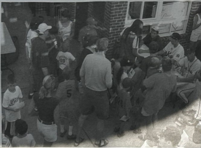
Big Train fans line up for autograph of future Orioles starter John Maine (BT 2000) at July 8 Frederick Keys Night at Povich Field.