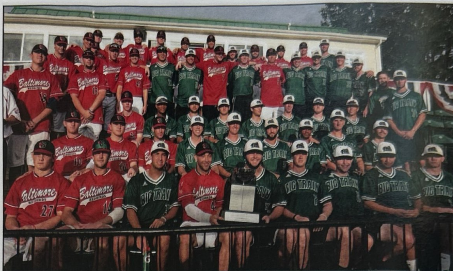
Crowned co-champions due to inclement weather, the Big Train and Redbirds pose together with the championship trophy.

week, driving in runs in five of the first seven contests, and homering in four. On the mound, Carlos Lomeli (St. Mary's CA) turned in the first dominant pitching performance of the season for Bethesda, firing five shutout innings in Loudoun on June 7, allowing just two base runners while striking out five Riverdogs. When Big Train's bats finally cooled off, Quinn Flanagan (Arizona) stepped up, tossing four innings of one-hit ball in a 4-1 victory over Rockville on June 9.