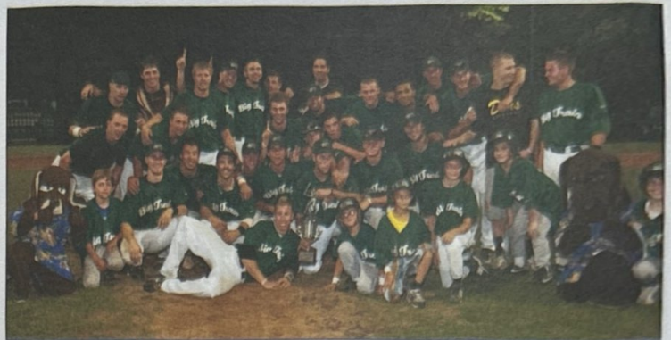
Bethesda Big Train, 2011 National Champions.