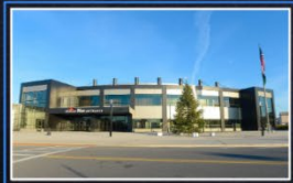
ADK BANK CENTER FRONT ENTRANCE