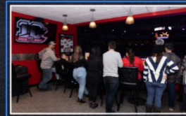
ADK BANK CENTER VIP SUITE