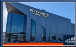
NEXUS CENTER FRONT ENTRANCE