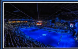
ADK BANK CENTER GAME-DAY