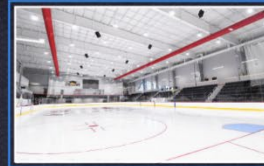
NEXUS CENTER FIELD 1