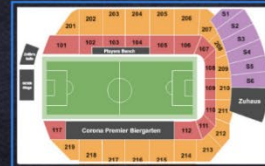
ADK BANK CENTER FLOOR MAP FOR GAMES