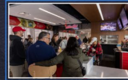
NEXUS CENTER UTICA CLUB