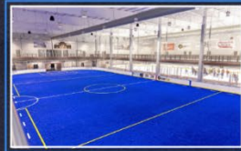
NEXUS CENTER GAME-DAY