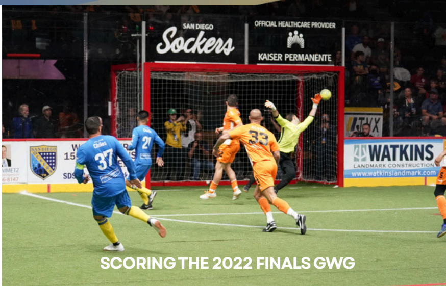
SCORING THE 2022 FINALS GWG