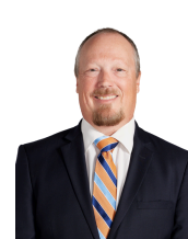
CRAIG ELSTEN Media & PXP